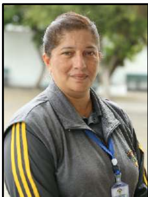
Farhat Malik Sports