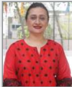
Sadaf Nasir Art