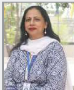
Huma Mehmood Art