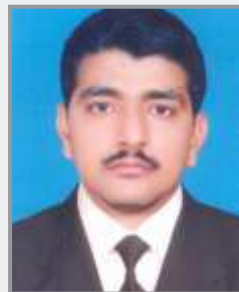
Umar Hayat Sports