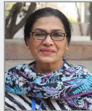
Naveed e Sehr Art & Design