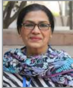
Naveed e Sehr Art