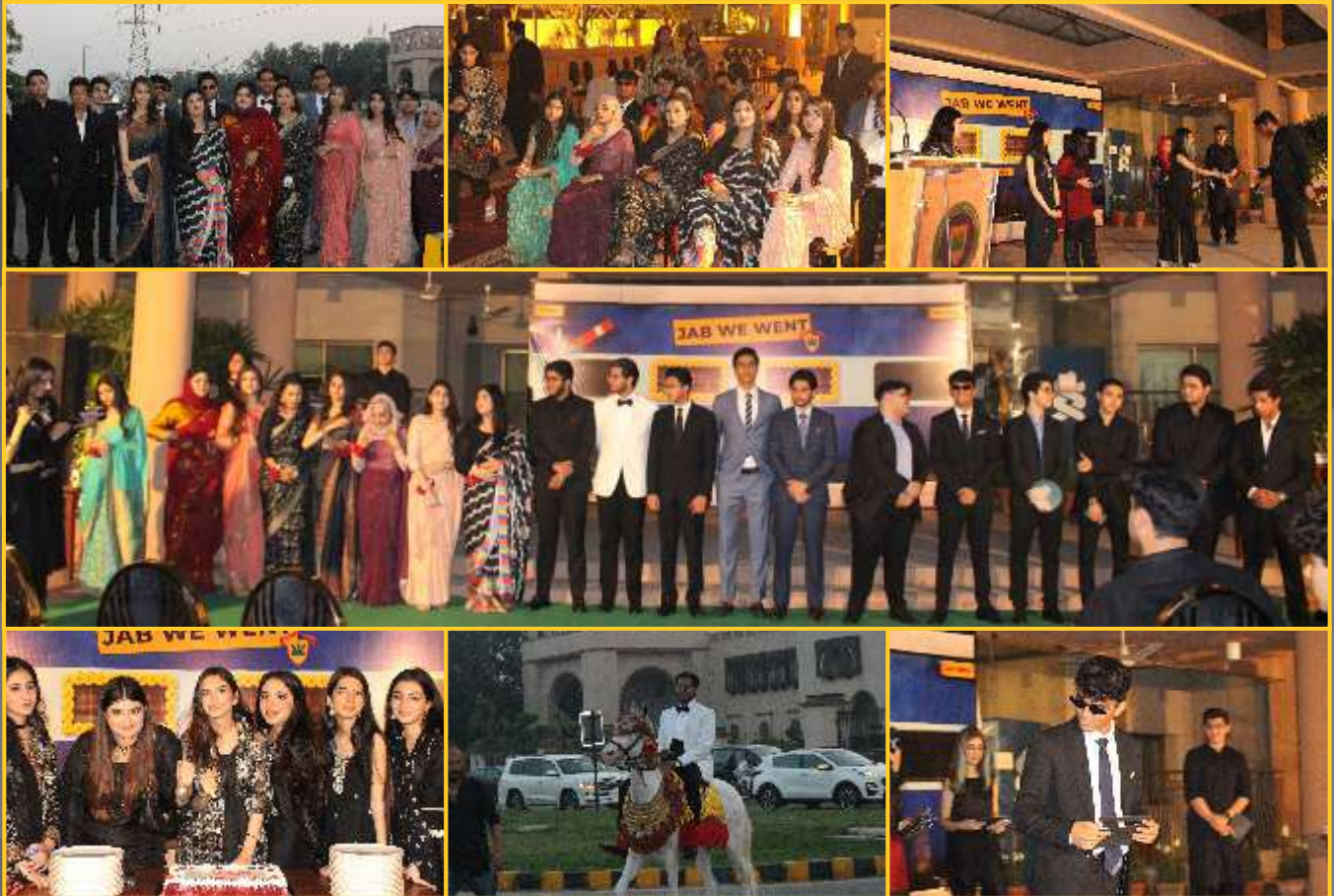
Welcome Class of 2023