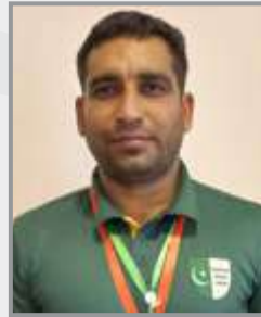
Waseem Abbas Sports