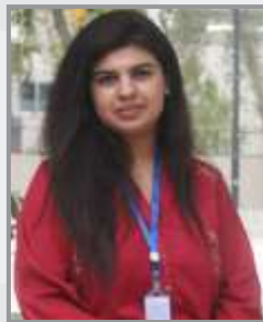
Iqra Ashraf Computer