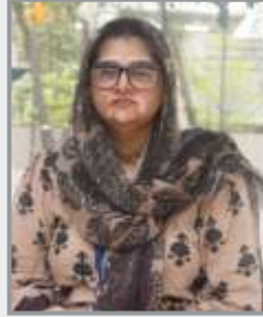
Afifa Maryam Library