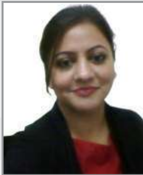
Zeshan e Khadijah Collaboratory