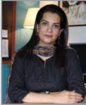
Ayesha Sajid Events & Activities