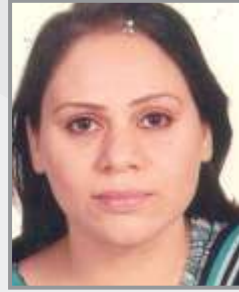
Fakhra Khan Urdu